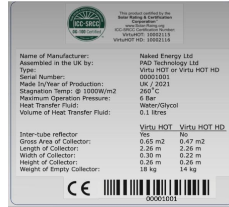
Actual certificate holder label with OG-100 legacy mark

It is important to always use the seal with care, as it elicits recognition and identifies origin, ownership and endorsement.